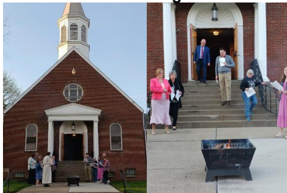
Easter Sunrise Community Service